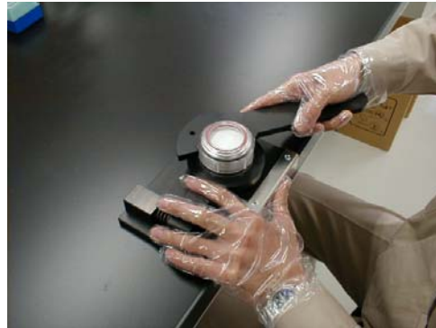
Tightening a stage by an exclusive torque for NILU holder