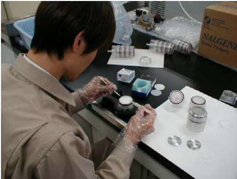
Mounting a filter on a stage