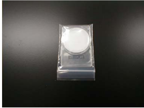
Sealed filter case