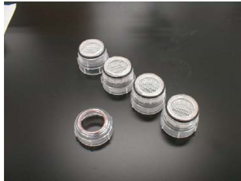
NILU filter holder (4 stage, open face)