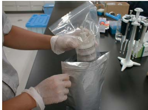
Sealed filter holder