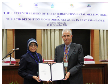
Indonesia presented the Instrument signed page to the EANET Secretariat representative