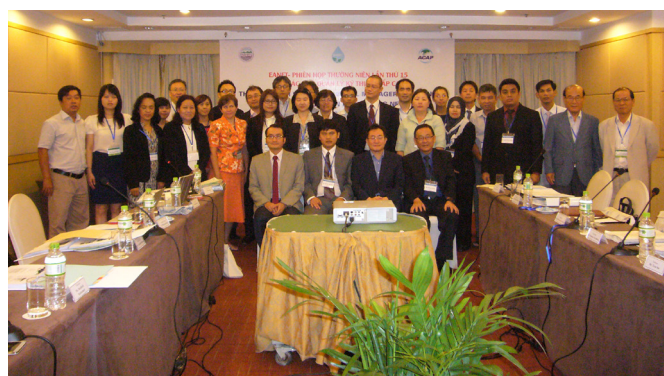
STM15 Participants, 4-5 Aug, 2013

The Fifteenth Senior Technical Managers' Meeting of the Acid Deposition Monitoring Network in East Asia was held on 4-5 August 2014 in Hanoi, Vietnam co-organized by the Network Center (NC) and Government of Vietnam. The meeting reviewed and discussed several important issues and reports of EANET, including (i) the Report on the progress of EANET since the Fourteenth Senior Technical Managers' Meeting (STM14); (ii) the overview of the preliminary draft Data Report 2013; (iii) the evaluation for the results of the Inter-laboratory Comparison projects 2013; (iv) consideration of the National Monitoring Plans (NMPs), current monitoring activities for the EANET monitoring and overall air concentration monitoring status of the participating countries; and (v) the progress report on technical activities of the EANET such as the status of the reviewing committee on the state of air pollution in East Asia. Latest status of air quality monitoring in Vietnam, and Introduction of Integrated Programme on Better Air Quality (IBAQ). The session also emphasized the importance of PM and ozone monitoring and its inclusion in the national monitoring plan, so that the QA/QC program and capacity building activities could be scheduled and supported by the EANET.