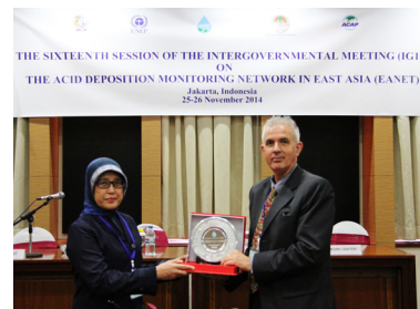
EANET Secretariat representative delivered the token to Indonesia

The Instrument signed by Indonesia made the completeness of Instrument signing by all 13 country members of EANET. The Instrument is though a non-legally binding agreement operationalized since 2012, it expresses the country's willingness to participate actively and contribute both technically and financially to the EANET on a voluntary basis.