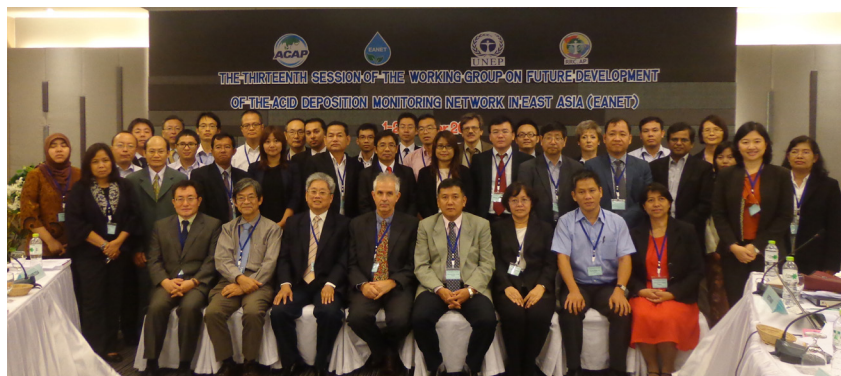
WGFD13 participants, 1-2 October 2014

The Thirteenth Session of the Working Group on the Future Development (WGFD13) of the Acid Deposition Monitoring Network in East Asia (EANET) was organized by the Secretariat for the EANET (RRC.AP) on 1-2 October 2014 in Ayutthaya, Thailand. Representatives from the EANET member countries namely, Cambodia, China, Japan, Lao PDR, Malaysia, Mongolia, Myanmar, Philippines, Russia, Thailand, and Vietnam participated in the Session. The Network Center (NC) for the EANET; United Nations Environment Programme, Regional Office for Asia and the Pacific (UNEP ROAP); Kanazawa University and Institute for Global Environmental Strategies (IGES) were represented.