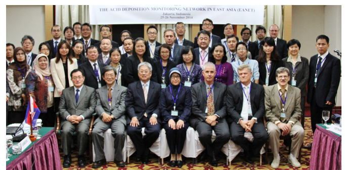
IG 16 participants, 25-26 November 2014

The Sixteenth Session of the Intergovernmental Meeting (IG16) was held on 25-26 November 2014 in Jakarta, Indonesia. The event was jointly organized by the Regional Resource Centre for Asia and the Pacific (RRC.AP) as the Secretariat for the Acid Deposition Monitoring Network in East Asia (EANET) and the Asia Center for Air Pollution Research (ACAP) as the Network Center (NC) for the EANET, and hosted by Ministry of Environment and Forestry, Republic of Indonesia. The representatives of the thirteen participating countries of the EANET, namely Cambodia, China, Indonesia, Japan, Lao PDR, Malaysia, Mongolia, Myanmar, Philippines, Republic of Korea, Russia, Thailand and Vietnam attended and participated in the Session. Experts from various international organizations were invited to attend, namely, the Secretariat of Convention on Long-range Transboundary Air Pollution (CLR-TAP), United Nations Economic Commission for Europe (UNECE); Institute for Global Environmental Strategies (IGES); and Kanazawa University.