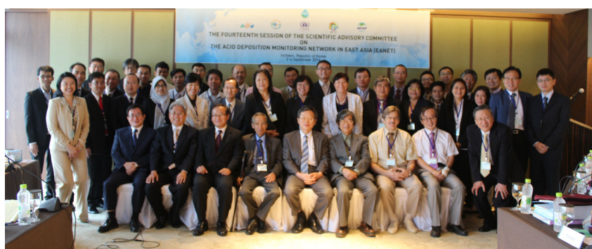
SAC14 participants, 2-4 September 2014

The Fourteenth Session of the Scientific Advisory Committee (SAC14) of the Acid Deposition Monitoring Network in East Asia (EANET) was held on 2-4 September 2014 in Incheon, Republic of Korea. The Session was hosted by the Government of Republic of Korea and co-organized by the Secretariat for the EANET (RRC.AP) and the Network Center (NC) for the EANET (ACAP). The Session was attended by the members of the SAC and/or their alternates nominated by the participating countries of the EANET, namely Cambodia, China, Indonesia, Japan, Lao PDR, Malaysia, Mongolia, Myanmar, Philippines, Republic of Korea, Russia, Thailand and Vietnam. Some experts from various scientific institutes, namely, the Atmospheric Environment Institute, Chinese Research Academy of Environmental Sciences, China; Hankuk University of Foreign Studies; and National Institute of Environmental Research (NIER), Republic of Korea also participated.